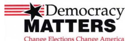
Adonal Foyle, Founder and President of Democracy matters

A handwritten signature in black ink that reads "Adonal Foyle".