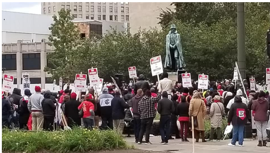
Metro Detroit AFL-CIO Affiliate Announcements!

http://miaflcio.org/constitutional-convention-2019/