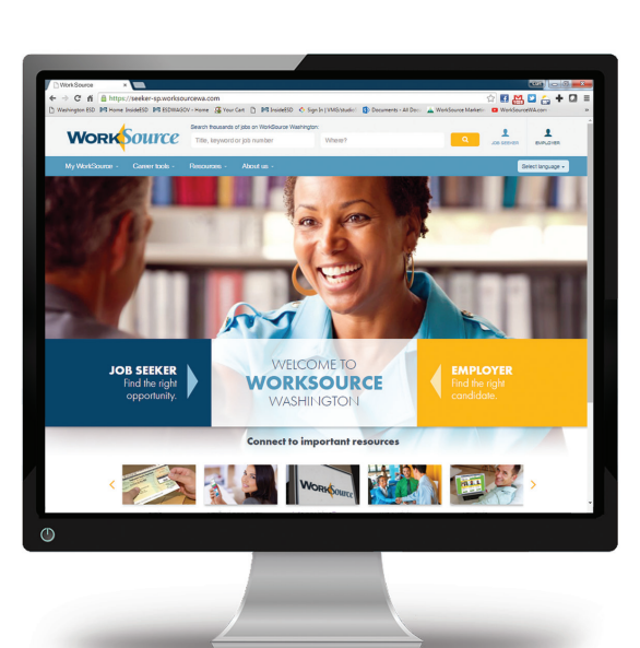
More job search and career resources than ever before.

WorkSource is an equal opportunity employer/program. Auxiliary aids and services are available upon request to individuals with disabilities. Washington Relay Service: 711