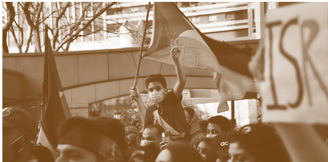
16 May 2021, Tunisia