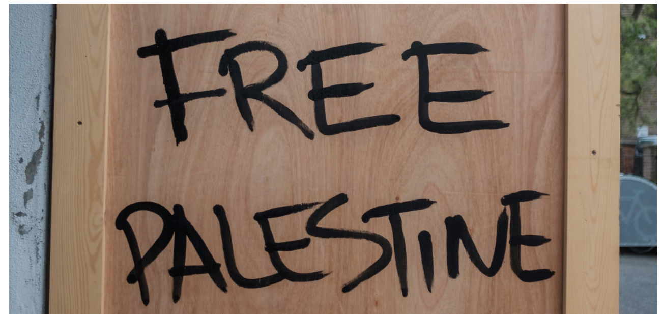
London, 15 May 2021