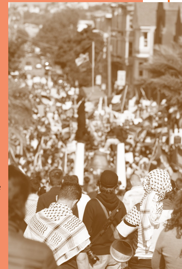
15 May 2021, San Francisco

In May of 2021 , the world bore witness to the mounting crisis unfolding in Palestine. Palestinians were being expelled from their homes in Jerusalem, particularly in Sheikh Jarrah. During the Holy Month of Ramadan Palestinians were brutally assaulted and barred from worshipping in the Al-Aqsa Compound and Israeli police raided Al-Aqsa, wounding hundreds of Palestinians. Palestinians throughout historic Palestine were tormented, beaten, brutalized, and killed by Israeli state and settler violence, and now face mass arrests. These events escalated into an 11-day Israeli bombing campaign on the Gaza Strip, which took the lives of 248 Palestinians, 66 of whom were children, displaced 107,000 people and resulted in the destruction of over 2000 homes in the Gaza Strip alone. More than 6000 Palestinians have been injured across historic Palestine during the uprisings and airstrikes.