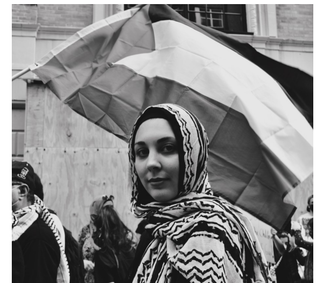
16 May 2021