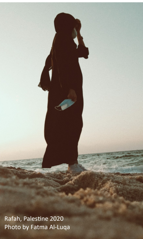
Rafah, Palestine 2020