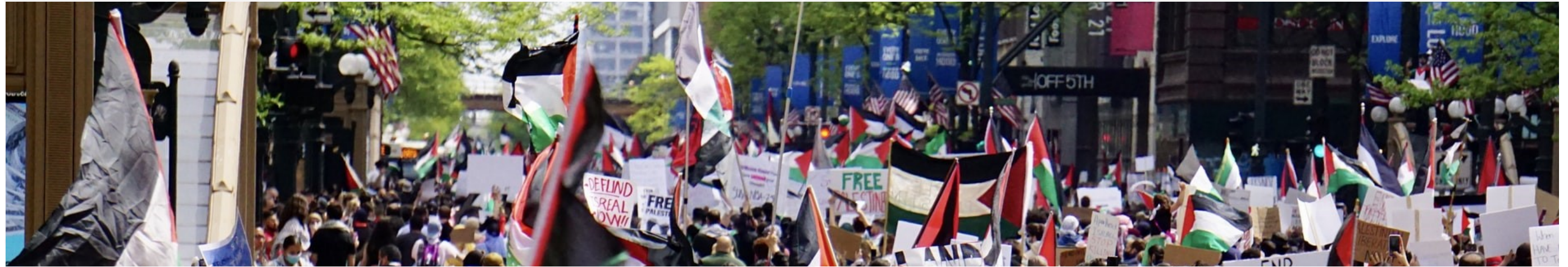
16 May 2021, Chicago