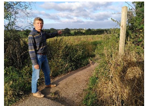
Land adjacent to Brundall Memorial Hall. We will work to maintain our green spaces

Greens on the Council will work with planners and developers to ensure local views and locally agreed plans are respected. But we cannot do that unless we are elected.