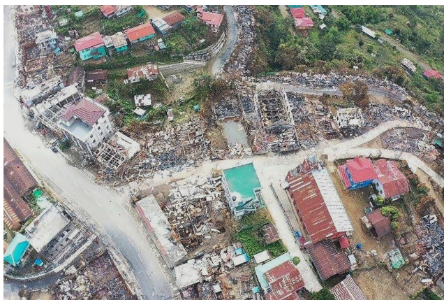
Buildings in Thantlang, Chin state burned to the ground by Burmese military.

Additionally, Aung San Suu Kyi faces 11 charges in total, and was most recently sentenced to two years in prison on December 6 for breaking COVID-19 restrictions (not wearing a mask while campaigning last year) and inciting opposition against the coup. On December 27, it was announced that the verdicts for two more of Aung San Suu Kyi's charges would be moved to January 10. These arbitrary verdicts demonstrate the junta's attempt to further delegitimize Aung San Suu Kyi's rule and uplift their illegally seized power to continue committing atrocities with impunity.