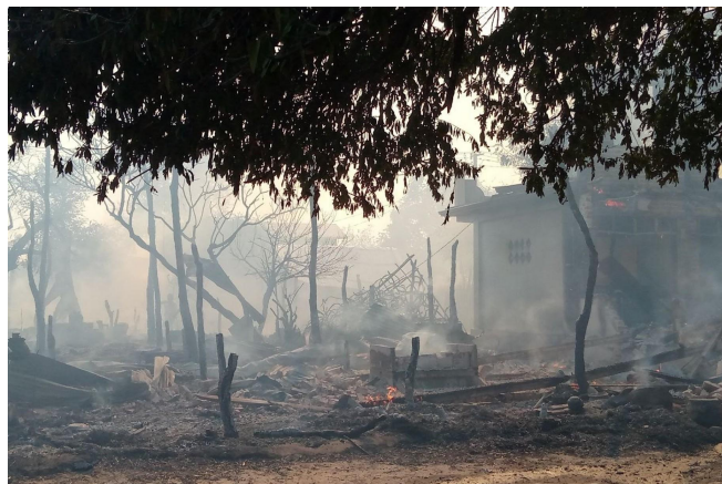
Burmese military burned multiple houses in Ke Bar village, Sagaing region on December 13.

December 20, the Burmese military launched an artillery attack and burned 20 homes in Karenni state's Loikaw township, with villagers describing soldiers as coming to "torch houses in the village for no reason."