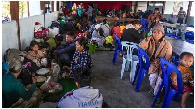
Villagers fled their homes and surrounding areas to multiple displacement camps.

*Name changed to protect their identity.