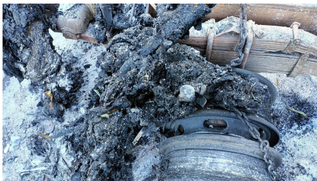
35+ unarmed civilians arrested, handcuffed, and burned alive by Burmese troops in Moso village, Karenni State.

Attacks on civilians in the ethnic states have continued to cause mass forced displacement and loss of life. Most recently, on December 25, it was reported that 35 villagers in Karenni state were killed by military soldiers who then burned the bodies in an attempt to conceal evidence. It is likely that the actual death toll is higher. Save the Children, an international humanitarian aid organization working in the region, has stated that 2 of its staff members were killed in the attack. While the Burmese military has always perpetrated violence in Karenni and other ethnic states, this most recent instance falls in a line of abuses that create a worrisome pattern- if the military continues to run with free reign, their attacks will echo the vicious crackdowns in Chin and Karen states seen earlier this year.