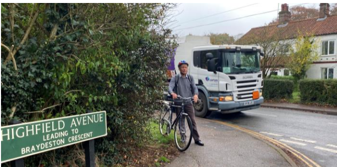
We are working with Brundall Parish Council on air quality and road safety - a concern for many villages