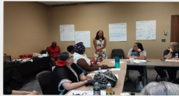
State Senator, Stephanie Chang