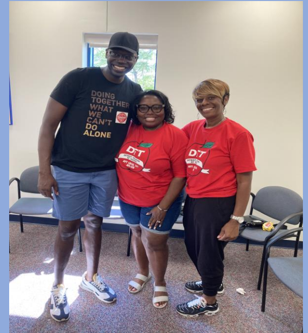
AFT Michigan Labor Day Barbecue Following the Parade With A Visit from the Lt. Governor, Garlin Gilchrist