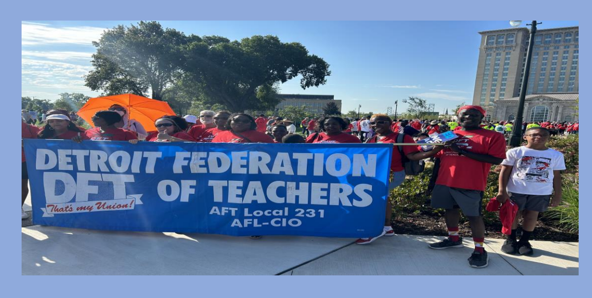
Labor Day Parade 2023 in Detroit