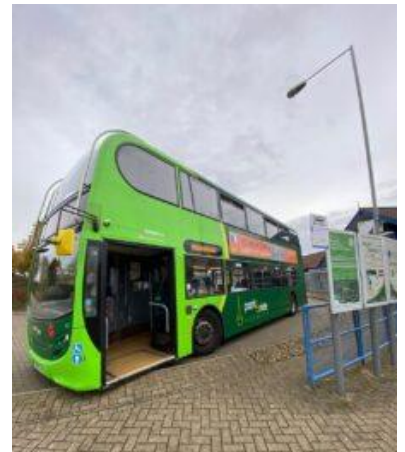
Postwick Park & Ride

Fares across all five Norwich park and ride bus services will be cheaper from September 2023, to make it more affordable to travel car-free into the city centre. All-day travel tickets will cost £3 for adults, £2 for concessions and 17-19-year-olds, £1.50 for children aged 5-16 and under fives go free. There will be a £1 fare for extra passengers when travelling with a paying customer.