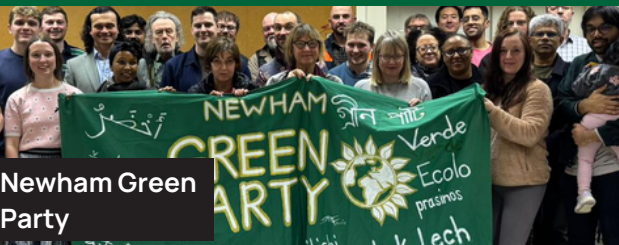
Newham Green Party

Please scan the QR code & select "Help Out"